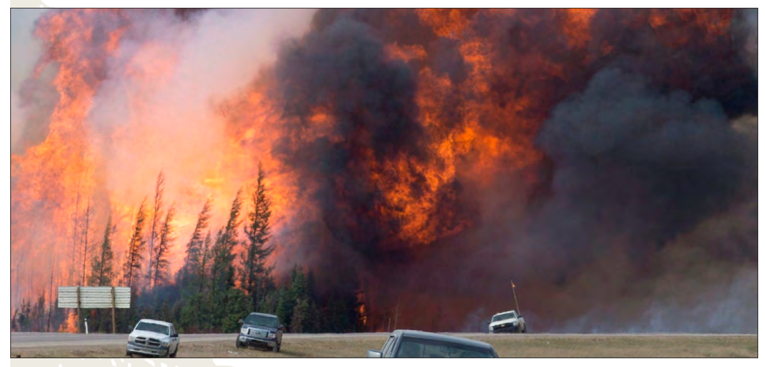
Fort McMurray wildfire on Hwy 63, 2016.