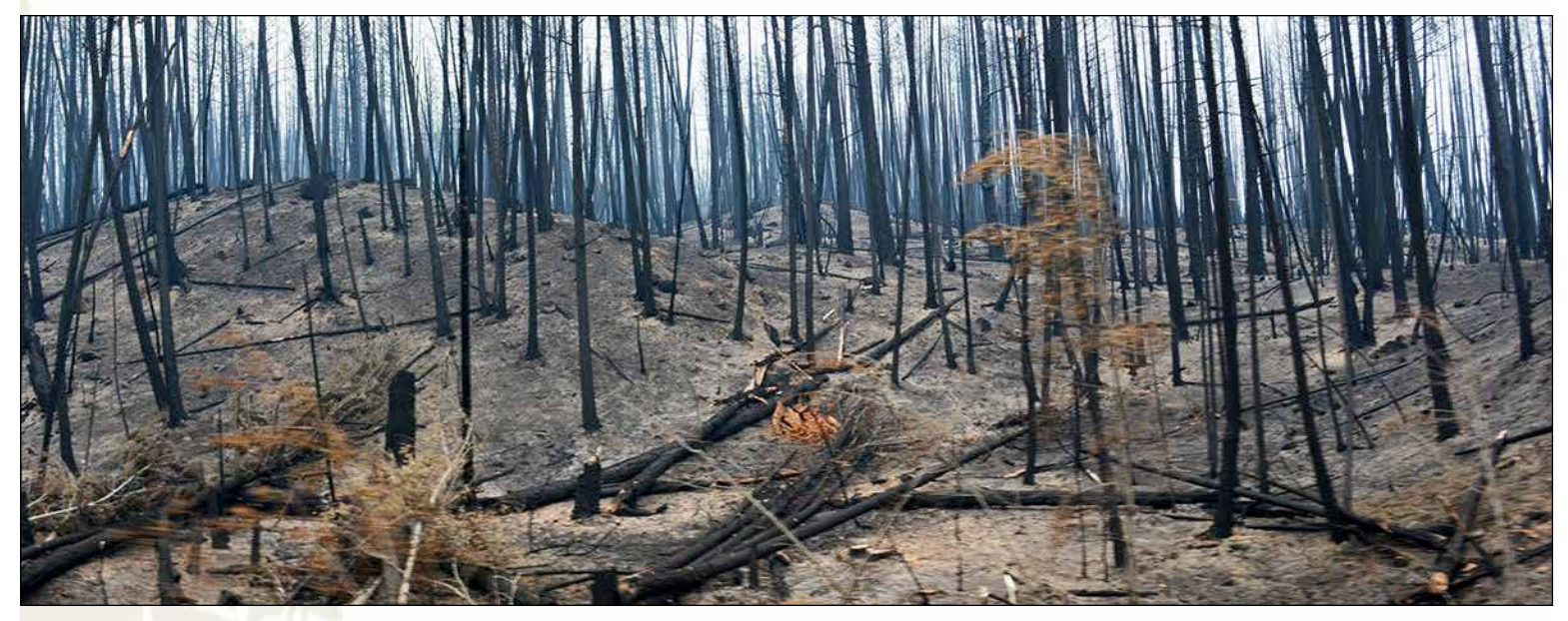
Forest reduced to blackened vertical sticks and ash after wildfire went through.

ground. Imagine covering your raised bed with plastic wrap and then turning on a sprinkler. Not only can it be inhospitable for new seedlings, it undermines watersheds and, in extreme cases, can result in flooding downstream.