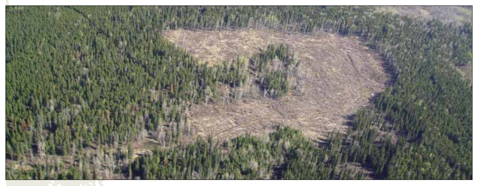
Aerial view of a cut block on Saulteau Woodlot License #231 in Moberley Lake (2007)