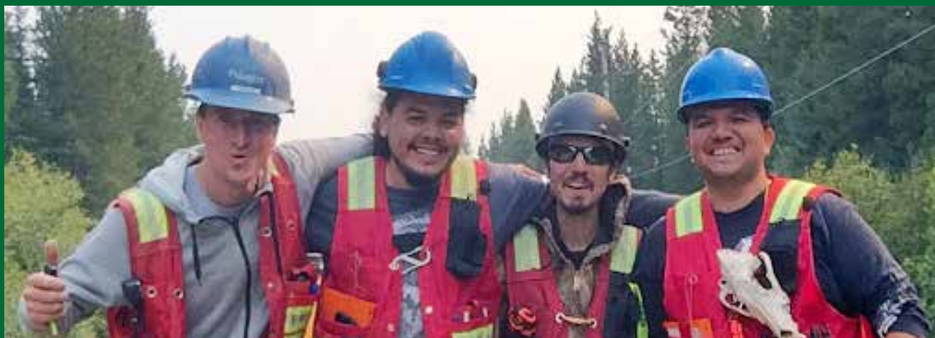
Osoyoos Indian Band and Vaagen Fibre Canada forestry workers conduct road maintenance inspections on the Osoyoos Indian Band Woodlot Licence and First Nations Woodland Licence near Oliver.

recovery and restoration has focused on recovering burned wood, increasing utilization of wood fibre, restoring traditional hunting grounds, replanting native shrubs and trees for biodiversity, preventing erosion, and the general clean-up of dead wood to prevent fir beetle infestations. Members from the OIB community are involved in every aspect of the work including layout, harvest monitoring, road maintenance, silviculture decisions, and manual fuel mitigation and treatments. (Vaagen Fibre Canada).