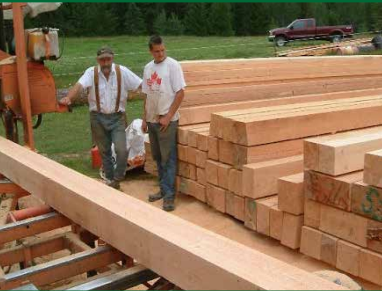
A small custom mill is part of a West Kootenay Woodlot Licence operation.