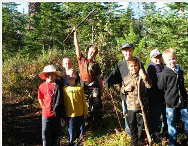
A past “Walk in the Woods”, W0272, Willow River Demonstration Forest

The Woodlot Licence program is a proud supporter of youth education, awarding two scholarships each year to students pursuing post secondary education or training, preferably in forestry.