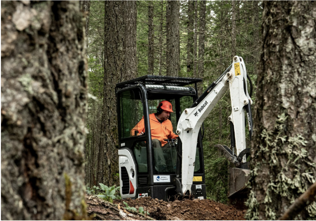
Rebuilding the Fine China Trail after harvesting on Woodlot Licence 0012.

licence. And, he’s made a point of attending community meetings to better understand the uses for his woodlot beyond his harvesting plans.