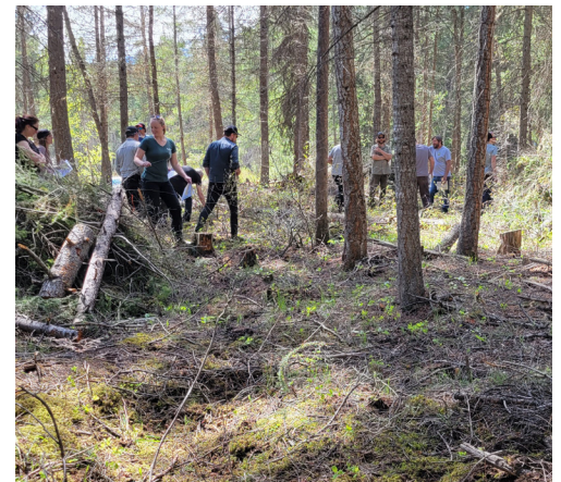
Wildfire risk reduction treatment done in Fall 2022 on W0456 in the Columbia Woodlot Association area.

Every year from April until the end of October is fire season in British Columbia. In BC, 20% of woodlots area (114,472 hectares) is within a high or extreme risk area for wildfire risk. However, there is work going on in BC where wildfire risk can be reduced. Some woodlot associations like the Columbia Woodlot Association and the Williams Lake Woodlot Association have organized funding and demonstrated treatments within woodlots there to reduce the wildfire risk.