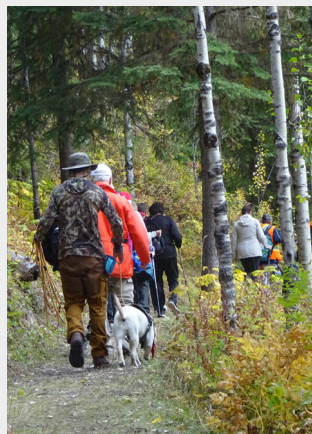
2022 “Walk in the Woods”, W0272, Willow River Demonstration Forest

The Woodlot Licence program is a proud supporter of youth education, awarding two scholarships each year to students pursuing post secondary education or training, preferably in forestry.