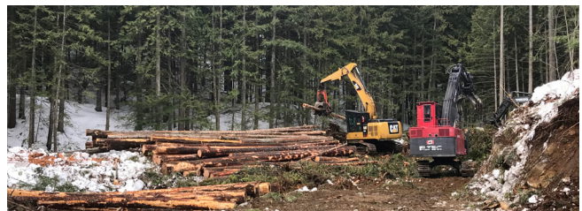
Winter logging on W1834 along Flowdown Trail, a part of Revelstoke Cycling Association’s Mount Macpherson trail network.