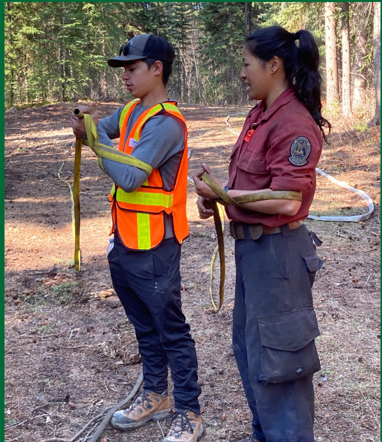
Students in Project Forest Management learn many skills during their forest field days, including how to wrap fire hose.