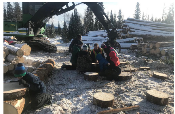
Taking a break from harvesting to teach local school children how to count tree rings.