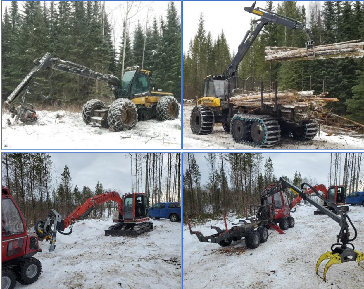
Figure 3. Harvester and Forwarder combinations currently in use in the Prince George area

Harvesting equipment typically consists of a harvester and forwarder combination. The harvester must have the ability to efficiently cut and process small stems within a 5-metre-wide access trail work space while minimizing damage to the residual stand of future crop trees. See Figure 3.