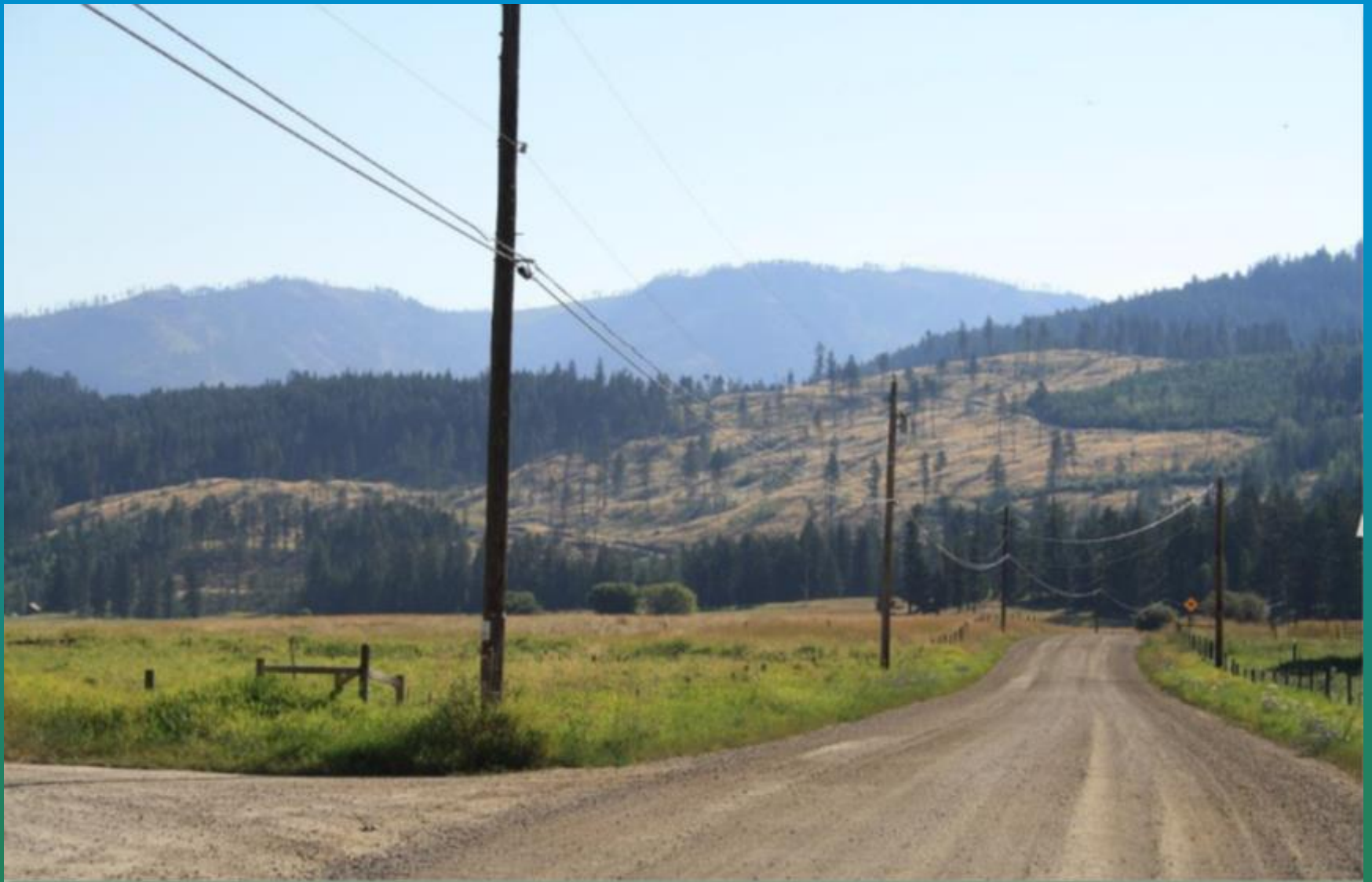
View of CP NN block 2 from the intersection of Skimikin and Byers Roads. This photo was taken at a 50mm focal length, which is close to what the human eye would perceive.