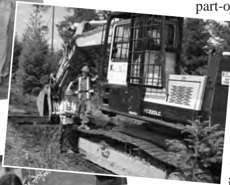
Twin Excavator Trainees on W1479