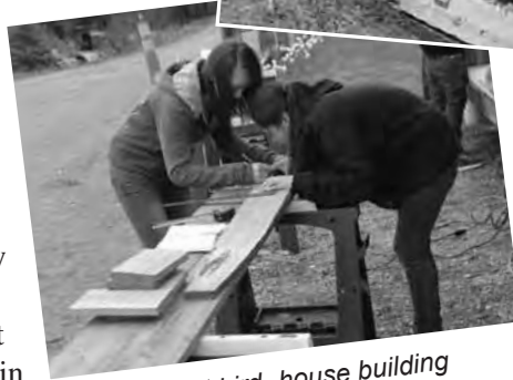
Student bird-house building competition at W 1479