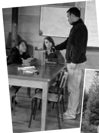
Grade 12's in the classroom at W1479

The future of this program is uncertain due to funding cuts at the district. ♦